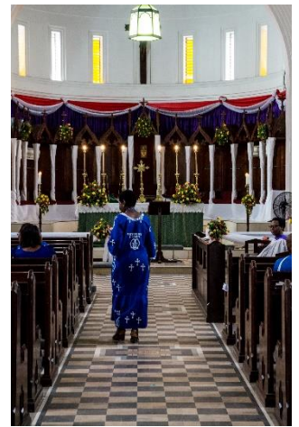
Mothers' Union member in St Alban's Cathedral, Dar es Salaam