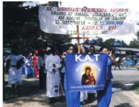
..... and Mothers' Union members highlighting social issues in city centre in 2013

Information below received from the Mary Sumner House on 13 August 2015: