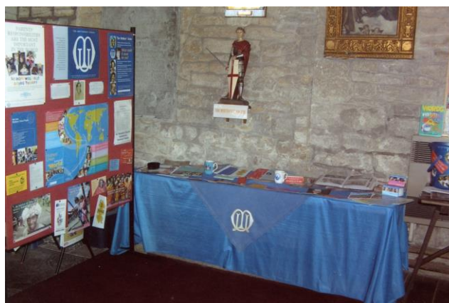
'Buckets of Love' display at Ashchurch [St Nicholas] raising awareness of Mothers' Union work bringing transformation to communities as well as raising funds for these projects