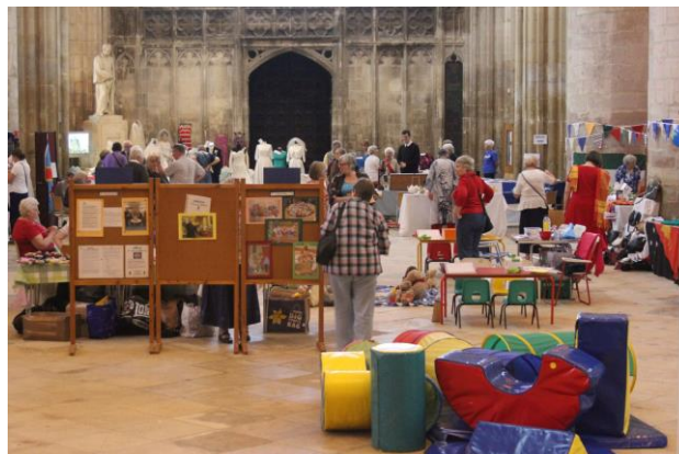
Mothers' Union members from across the diocese setting up the stalls in the Nave of Gloucester Cathedral for the 'Families come First' Awareness Day Event

Merciful Father, accept these prayers for the sake of your Son, our Saviour Jesus Christ. Amen.