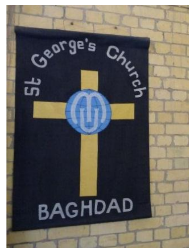
Mothers' Union Banner on display in Baghdad [St George] Church Iraq