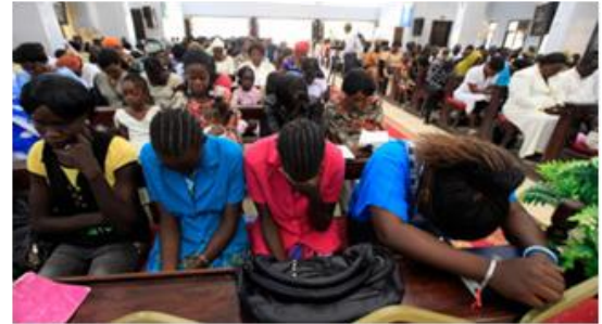
..... and members praying at an Easter Day Service

Information below received from the Mary Sumner House on 13 August 2015: